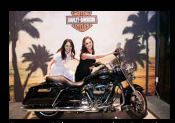
Guests pose with a live auction prize, the Harley-Davidson 2017 Roadking Motorcycle

Because of our generous partners, AMCHAM was able to provide six live auction packages, 17 silent auction packages and 98 raffle items for our guests to enjoy with family and friends! Guests were free to bid on the silent auction and buy raffle tickets throughout the night. As the high point of the Inaugural Ball, the live auction began around 9:30pm. The ballroom filled with anticipation as our professional auctioneer began