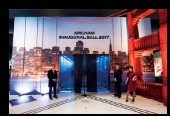
The Golden Gate Bridge entrance into the foyer