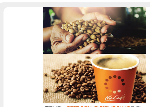
맥도날드는 <mark>환경과 커피 농장 커뮤니티의 보호</mark>를 돕는 농법으로 재배한 열대우림동맹 인증 커피 원두 100%를 사용합니다

Rising global demand for coffee, combined with more erratic weather patterns relating to a changing climate, labor shortages and the remote nature of coffee growing, is adding to the pressure on the world's coffee-growing communities.